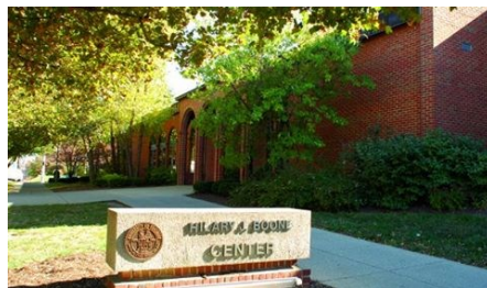
Hilary J. Boone Center